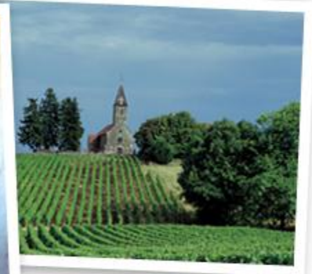
TERRES DE CHATENAY